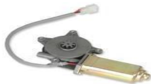
Fig 2. DC Motor

DC motor is a device that converts electrical form into mechanical form of energy. There are many kind of DC motor such as DC motor, separately excited DC motor and self-excited DC motor. DC motor was powered by DC current. There are various voltage input for DC motor and the common voltage input for DC motor are 3V, 5V, 12V, and 24V. There are advantages for DC motor which are the DC motor perform better than AC motor, and DC motor provide excellent of controlling the speed.