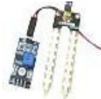
Fig 4. Moisture sensor

Irrigation is limited to first few times due to growth of crops. The moisture content of soil is checked by analog sensor. And the water is feed using a PWM controlled water pump till moisture content reaches the level set by user through application.