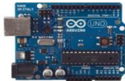
Figure 1: Arduino Uno.

It is a circuit board of credit card size. It consists of both a microcontroller which is the physical programmable circuit board and a software, or IDE (Integrated Development Environment). It keeps running on PC and is utilized to compose and transfer program code on a PC.